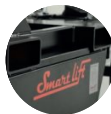
Prepared for forklift