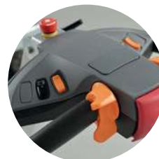
Battery indicator on drive handle