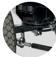
Quality bearings allow tilting motion